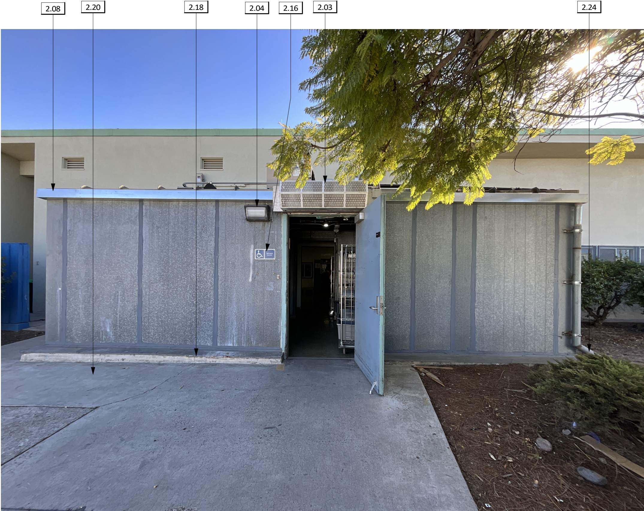
1 EXTERIOR DEMOLITION ELEVATION - ENTRANCE 1" = 20'-0"