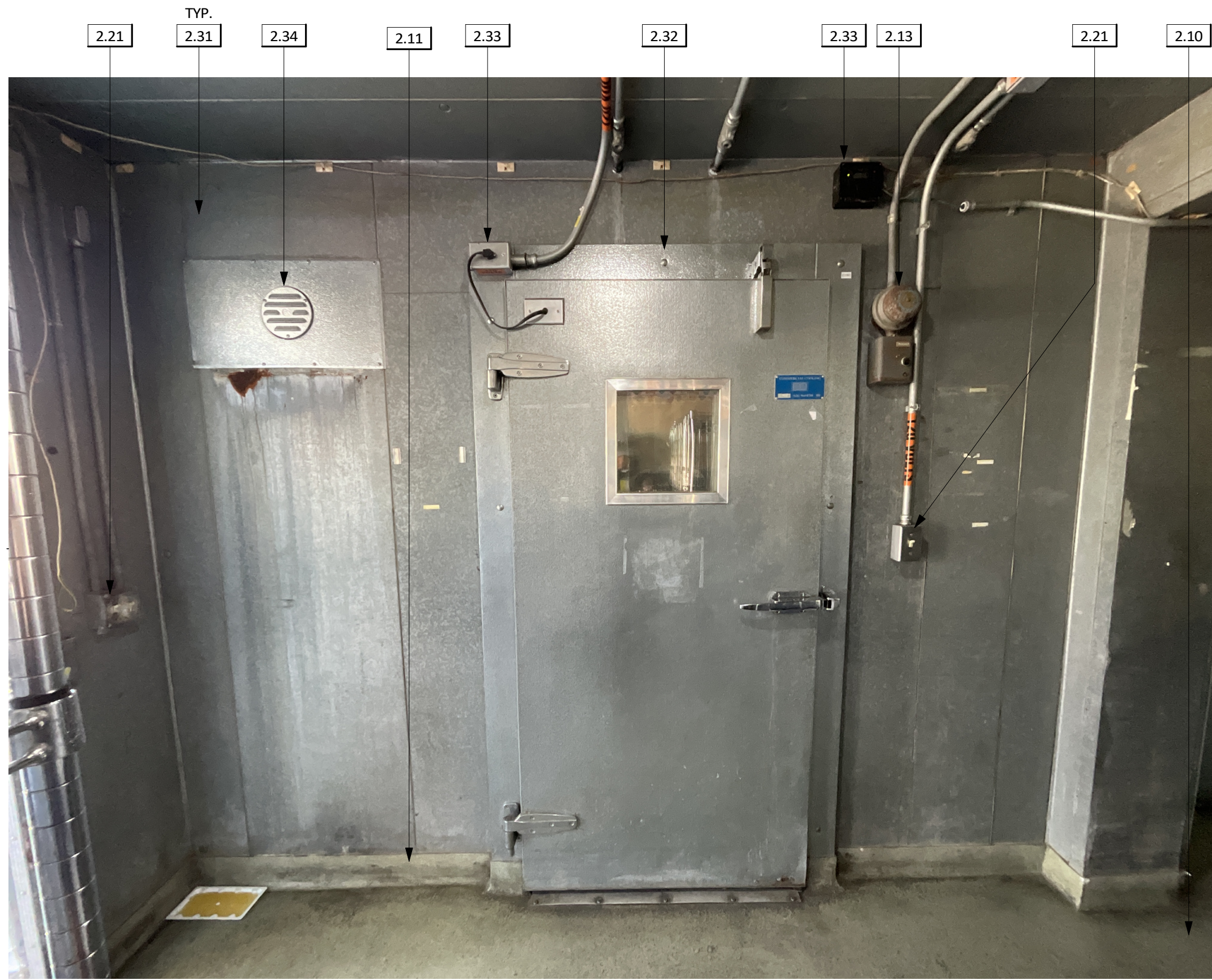
3 INTERIOR DEMOLITION - VESTIBULE 1" = 20'-0"